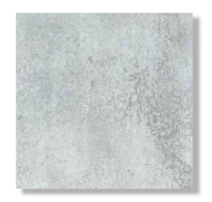
A R C T I C