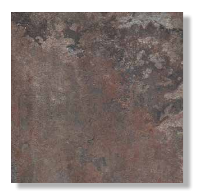
I N D I A N