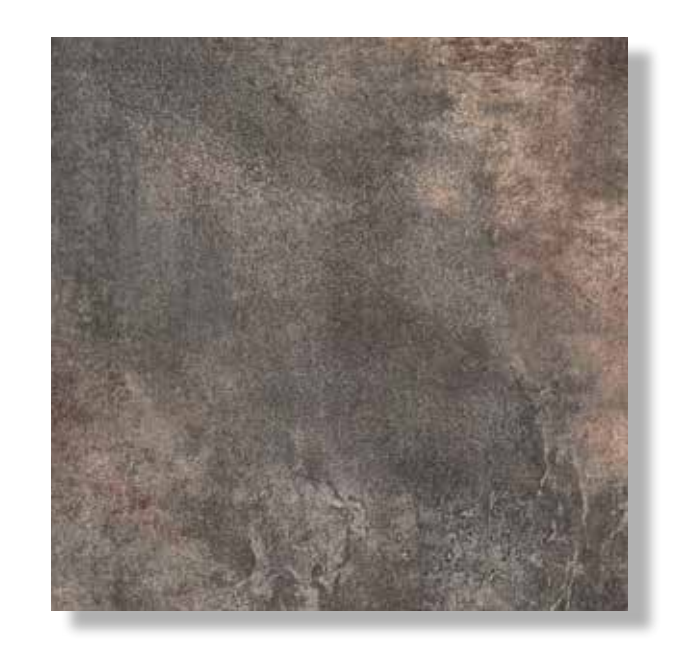
P A C I F I C